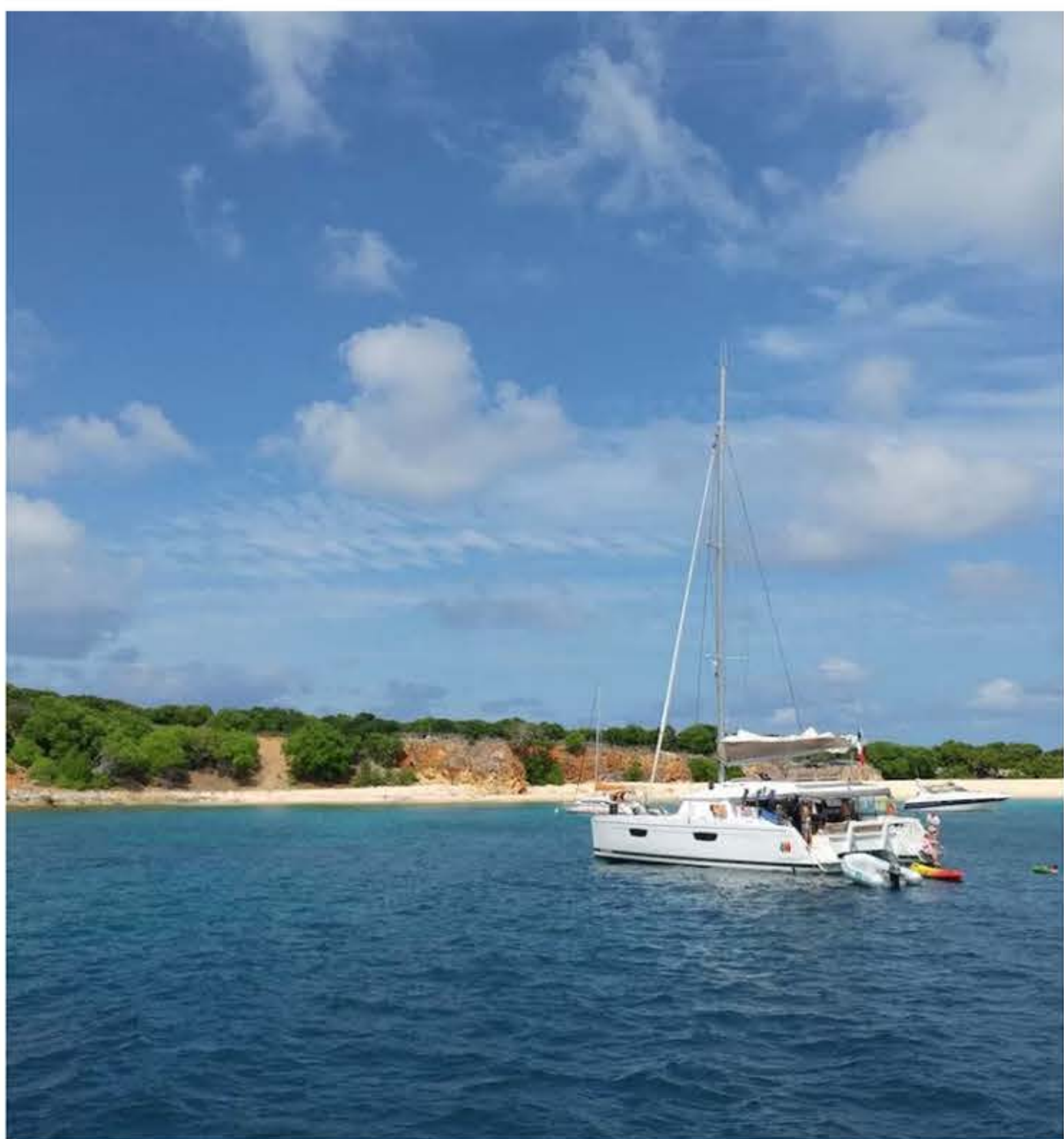
A TradeWinds pit stop

Life on board a TradeWinds charter also allows for more freedom and flexibility. On your trip, you'll visit well-trodden spots, hidden swimming coves and all the romantic isles in between — sans swarms of tourists — where you can swim yacht-side, snorkel with magical sea creatures, explore, paddle board, kayak, hike and more, all at your leisure.