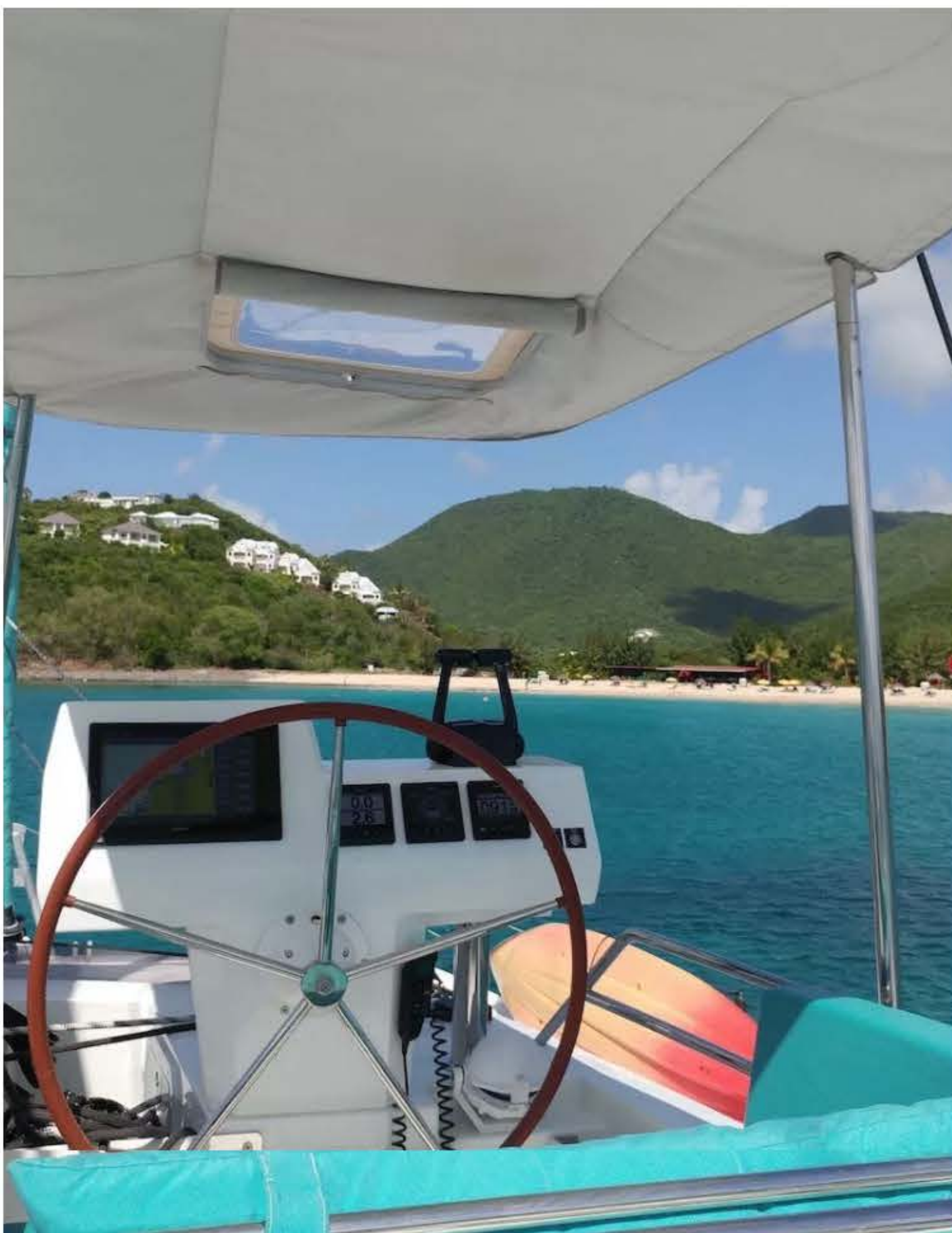
The Captain's seat