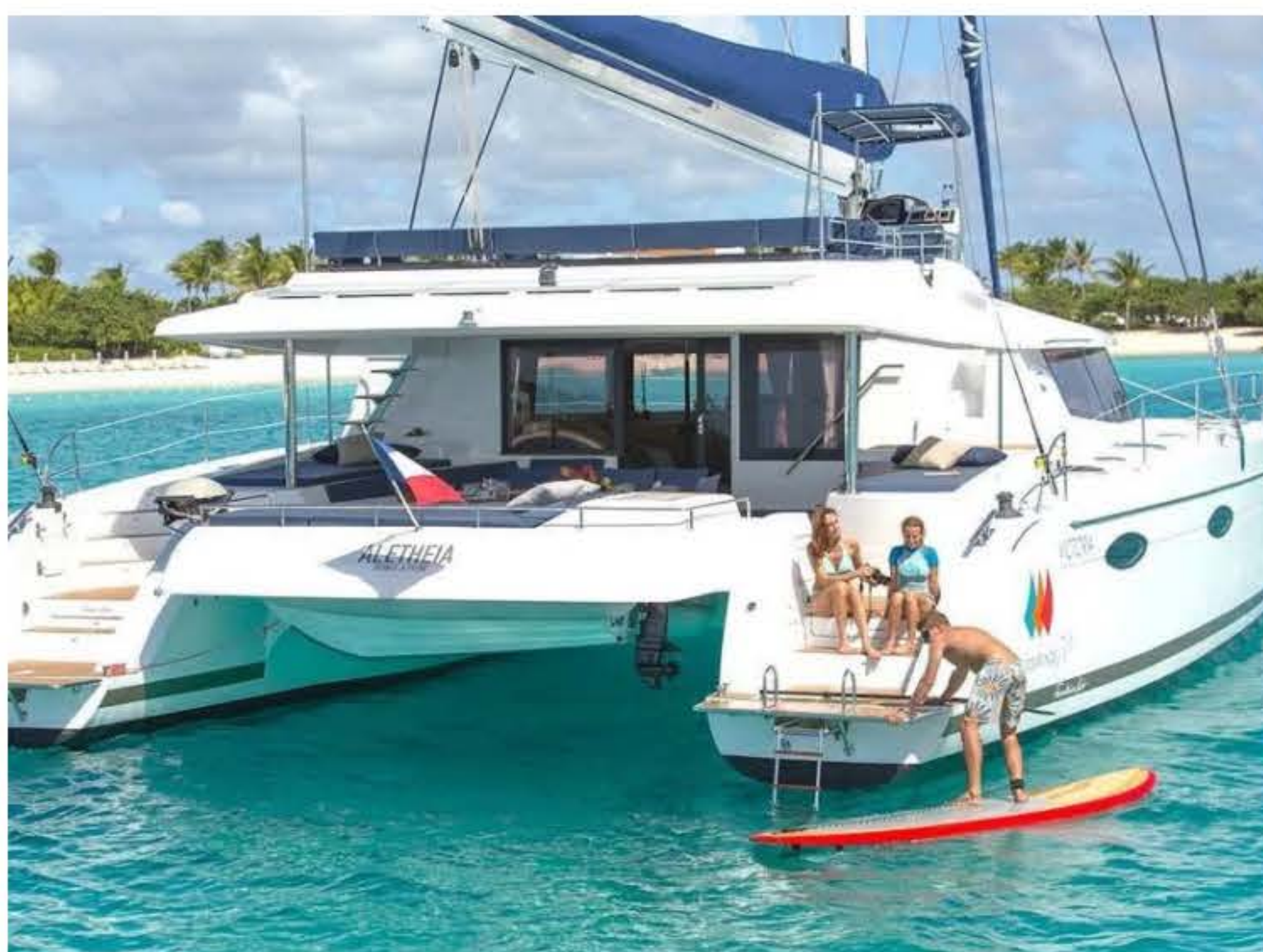
Just one of the yachts in TradeWinds' fleet