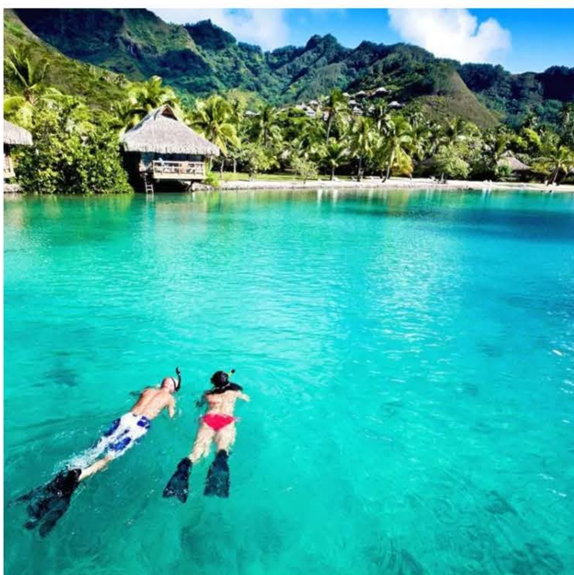
TradeWinds members snorkel in French Polynesia

But unlike the typical cruise ship scenario, you're not just another face in the crowd. Each charter, private or shared, comes with an attentive staff of two; a captain and first mate that act as scuba diving instructors, concierges, on-board chefs, and the like.