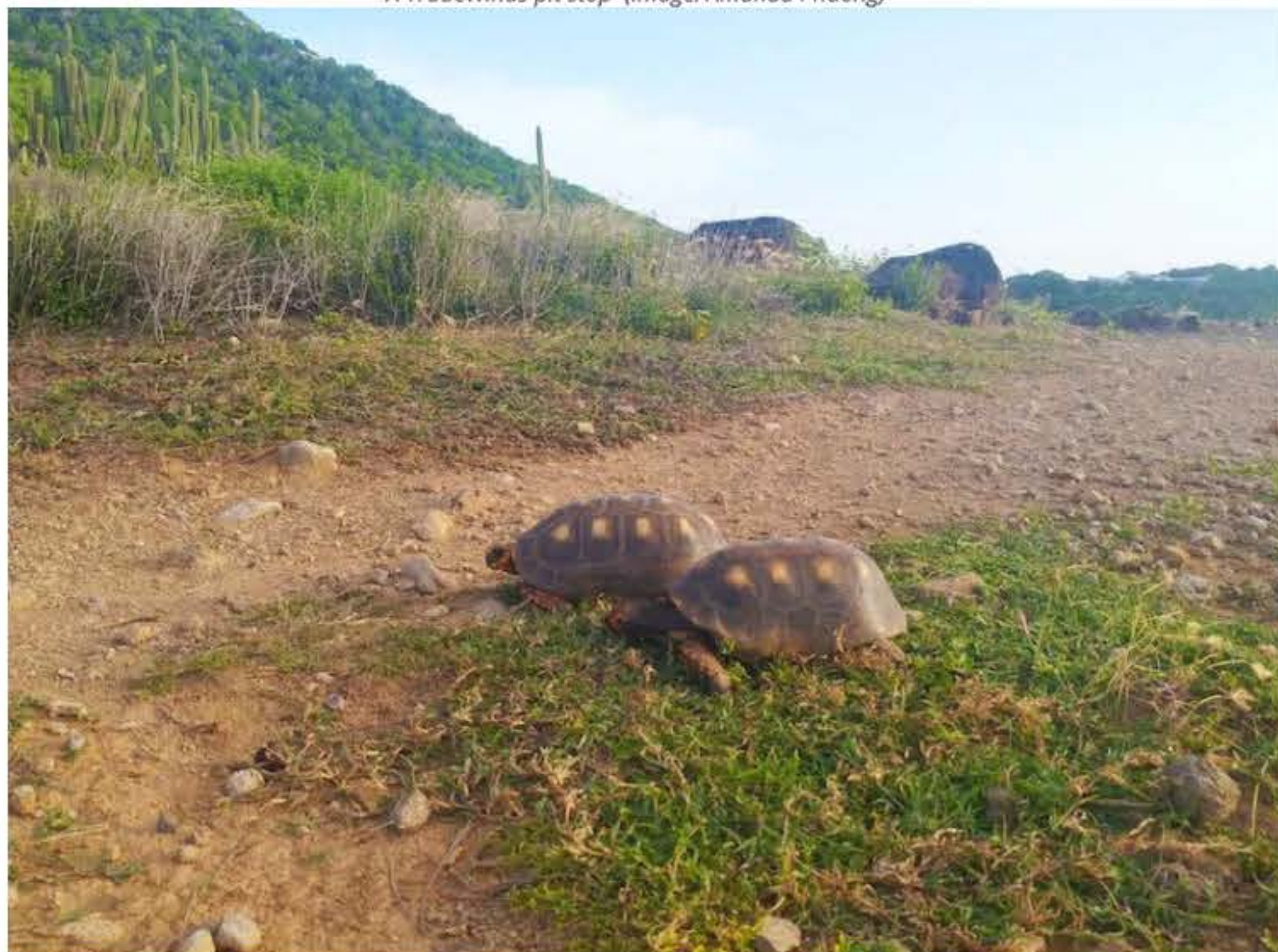
Red-footed turtles wander Colombier Beach (Image: Amanda Phuong)

And I can personally attest to the magic that is a TradeWinds vacation. I had the pleasure of hopping aboard a charter that sailed around Sint Maarten, Anguilla and Saint Barthélemy. The trip started on the the Dutch side of Sint Maarten, where I met the crew and spent the night before taking off into the beautiful ocean. A group of 10 — a mixture of longtime TradeWinds friends and fresh faces — made way to a number of islands, including Sandy Ground for tropical cocktails at the famous Elvis Beach Bar, Colombier Beach where we hiked alongside red-footed tortoises outside the Rockefeller's abandoned mansion, Gustavia for world class shopping while on the lookout for celebrities, Grand Case for 4-star dining, and Tintamarre Island