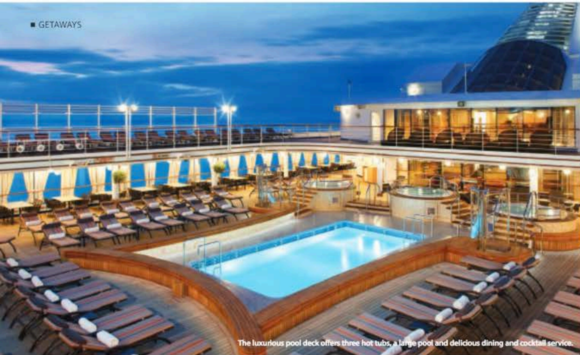
The luxurious pool deck offers three hot tubs, a large pool and delicious dining and cocktail service.