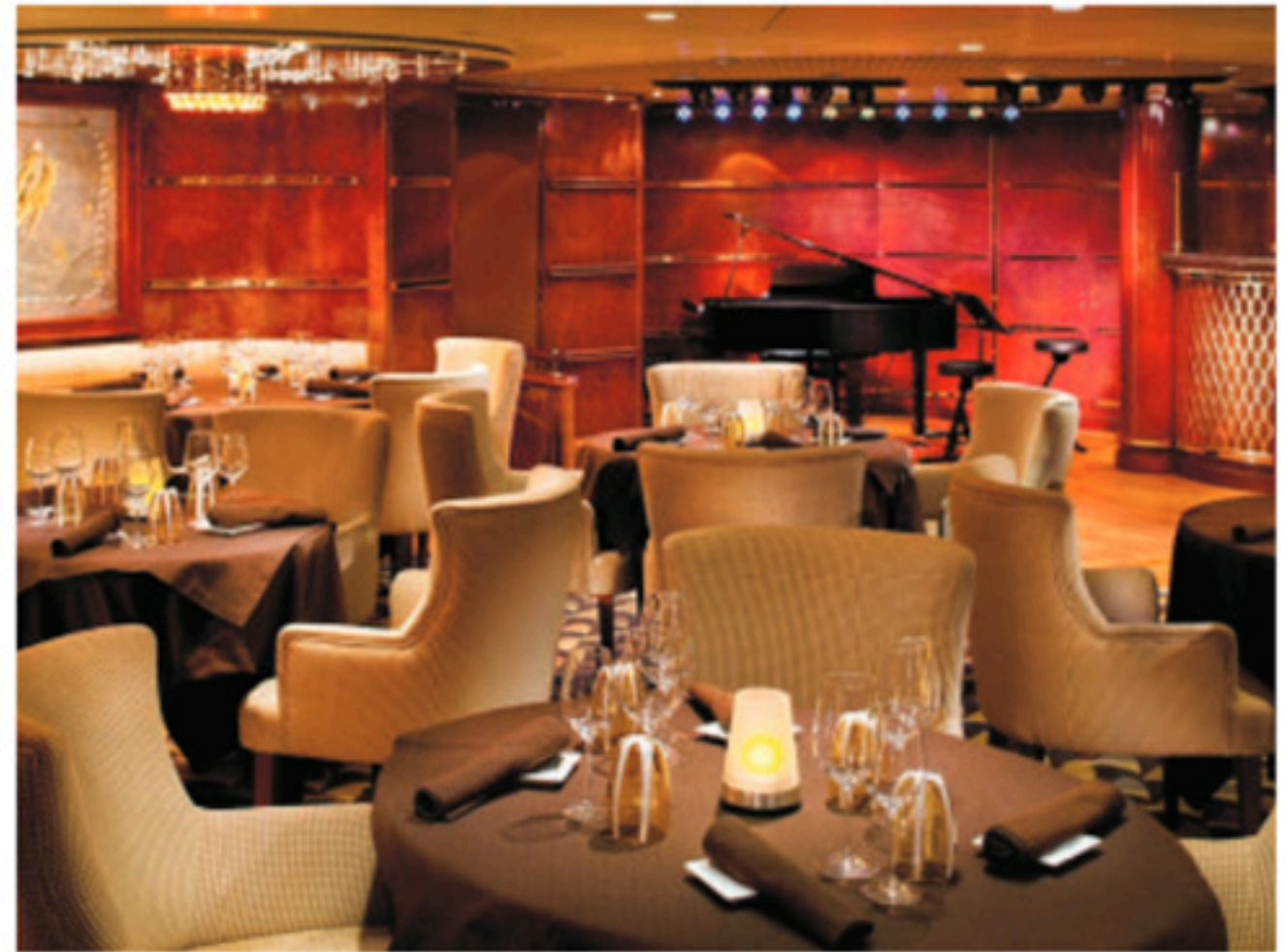
Stars Supper Club offers live performances, small plates and cocktails in an incredible ambience.

For us, our favourite after-dinner spot is our suite's deck. As we watch the lights bounce off the sea, we enjoy cocktails and conversation about the stunning day we just enjoyed, and make plans for another exciting day tomorrow. 🍷