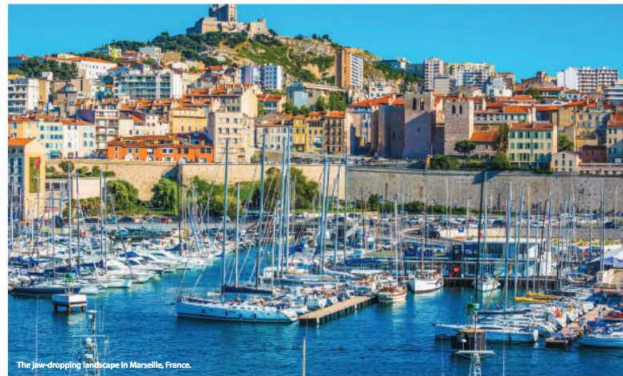
The jaw-dropping landscape in Marseille, France.

Out of our suite, we explore our new home which includes a library, cigar lounge, casino, world-class spa and fitness centre, various restaurants, bars and cafés and of course, the glamorous pool deck. With sun hats and books in hand, we make our way to the pool. As we find a spot to read, the pool and hot tubs (three of them) glisten under the Italian sun. We are offered towels and loungers and our drink order is taken. As towels are laid out for us, and we skim the menu, relaxation begins to sink in... we are here in Europe, aboard one of the world's most luxurious cruise ships and I'm going to soak in every moment.