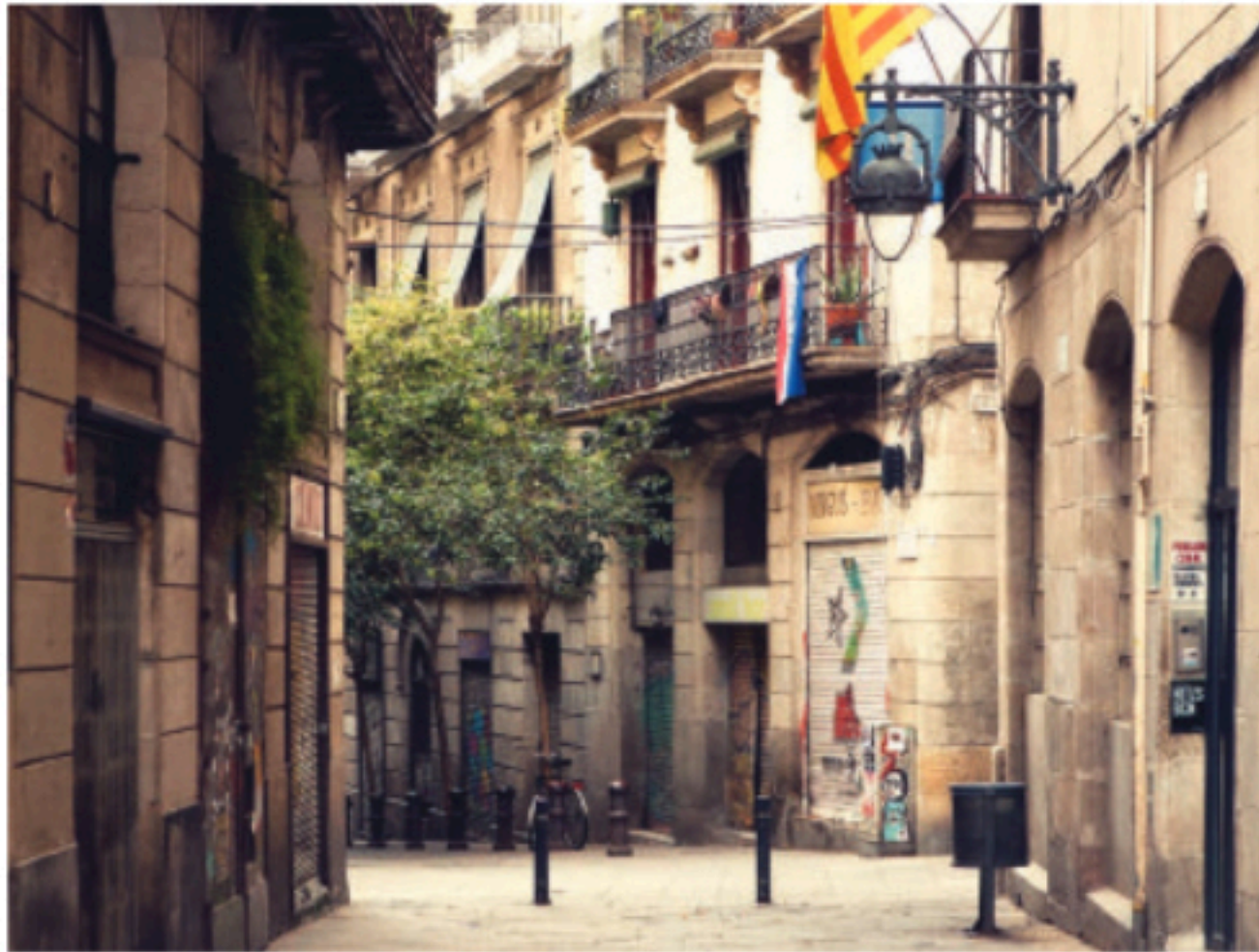
The famous Gothic Quarters in Barcelona offers fabulous shopping, dining and historic sights.

» meats, fresh olives and bread, and of course, wine tasting. Bravo!