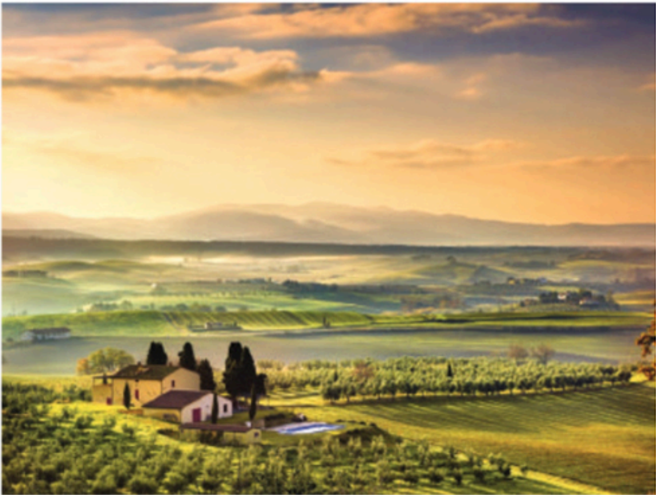
The vivid scenery in Tuscany.

» many other gourmet delights, but aboard the Silver Spirit the cuisine is also incredible. With gastronomic excellence its mission, the Silver Spirit makes dining not only delicious, but an experience. There are six restaurants (plus in-suite dining, that we indulge in for breakfast each morning while we take in our private view), all of which offer five-star dining, unimaginable views and impeccable service.