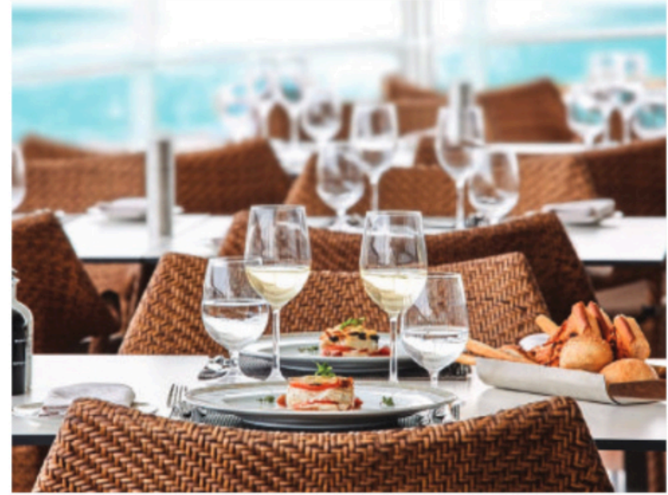
Special attention to customer satisfaction.

No one goes to Italy expecting to be hungry. Not only does each village, town and city we visit tempt us with pasta, gelato, wine and pizza among »