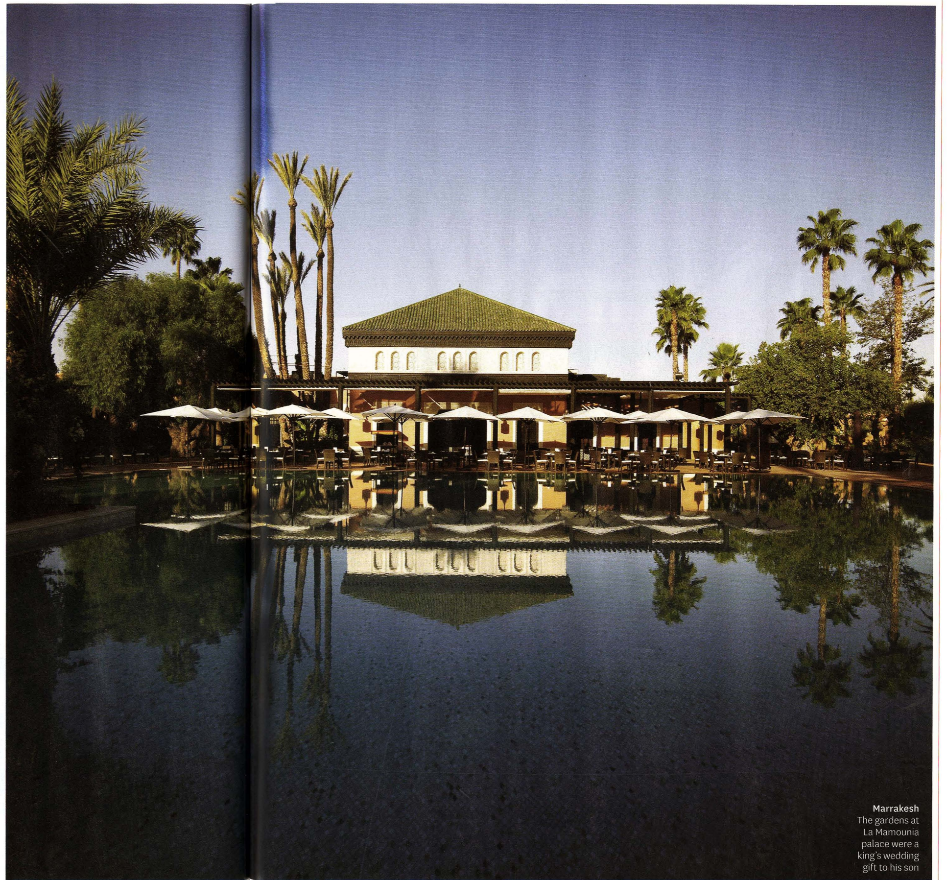
Marrakesh The gardens at La Mamounia palace were a king's wedding gift to his son