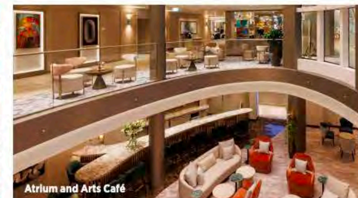
Atrium and Arts Café