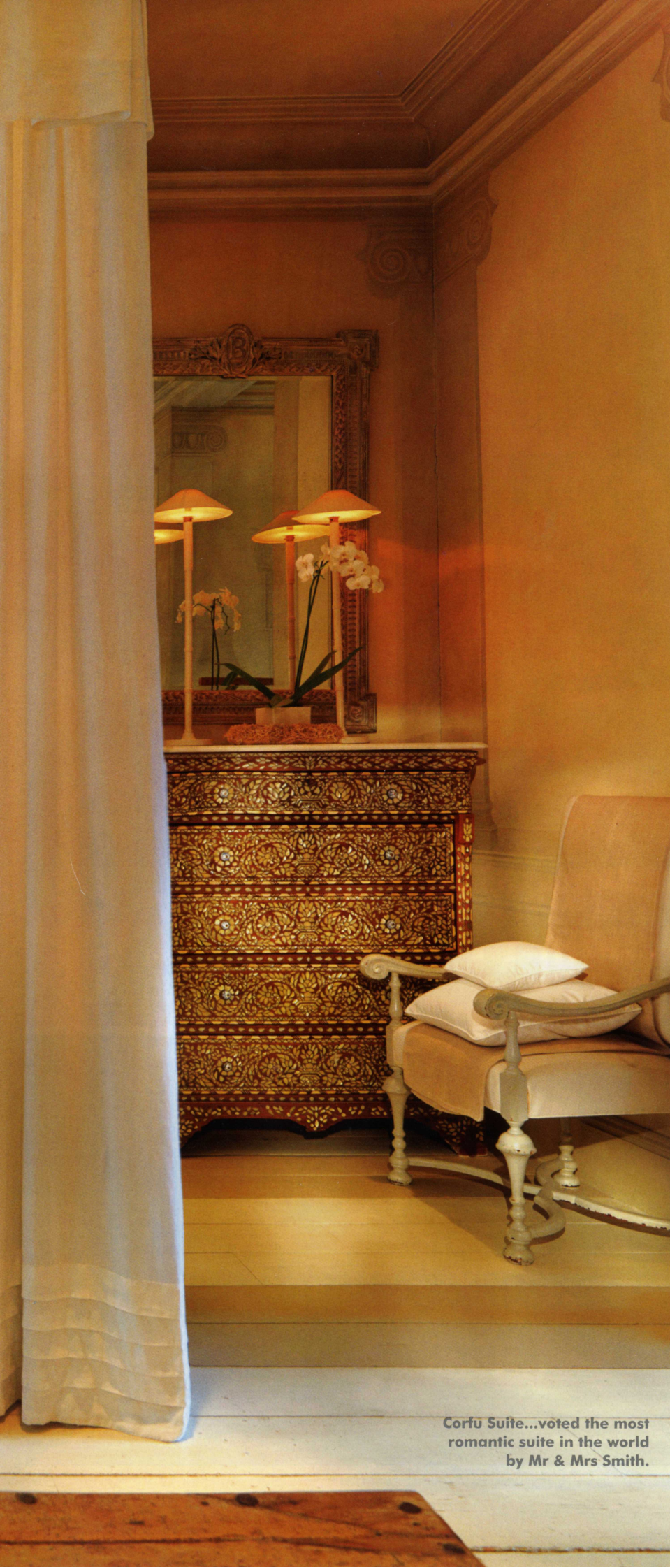
Corfu Suite...voted the most romantic suite in the world by Mr & Mrs Smith.