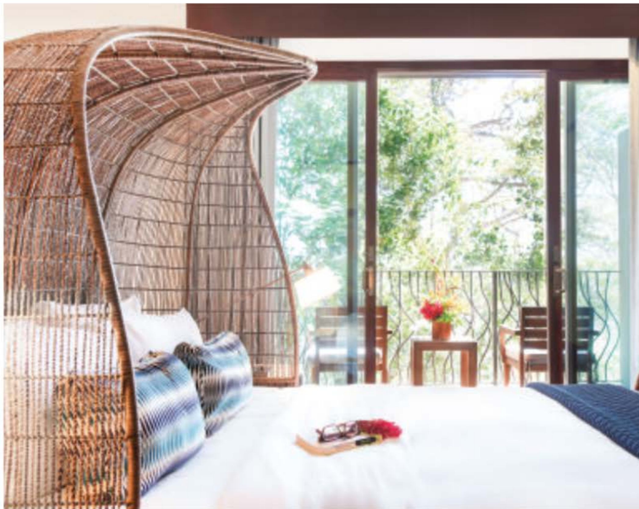
Each of the bedrooms at Exclusive Resorts Peninsula Papagayo has a private patio and outdoor shower.

» outdoor eating area as well as lounging area around a private infinity pool and hot tub. They have not forgotten an outdoor grill and cooking station any home cook would lust after.