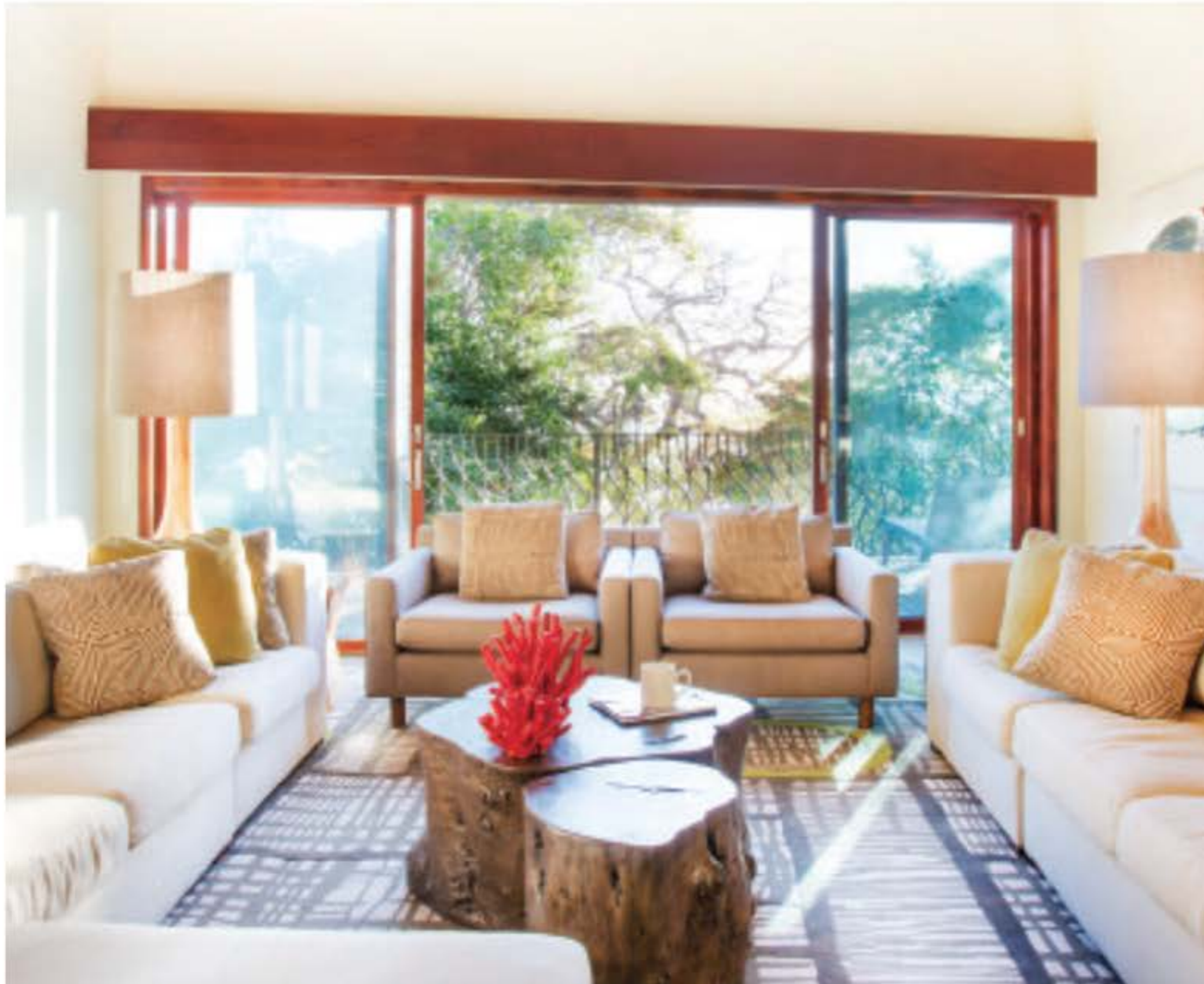
The main living space at a villa at Exclusive Resorts Peninsula Papagayo.

» The region known as the Gulf of Papagayo is located on the Northwest Pacific Coast of Costa Rica, a short drive from Liberia and Daniel Oduber International Airport. Much of the area has been designated a National Park known as Santa Rosa, renowned for its excellent weather, bays of tranquil water and stunning scenery.