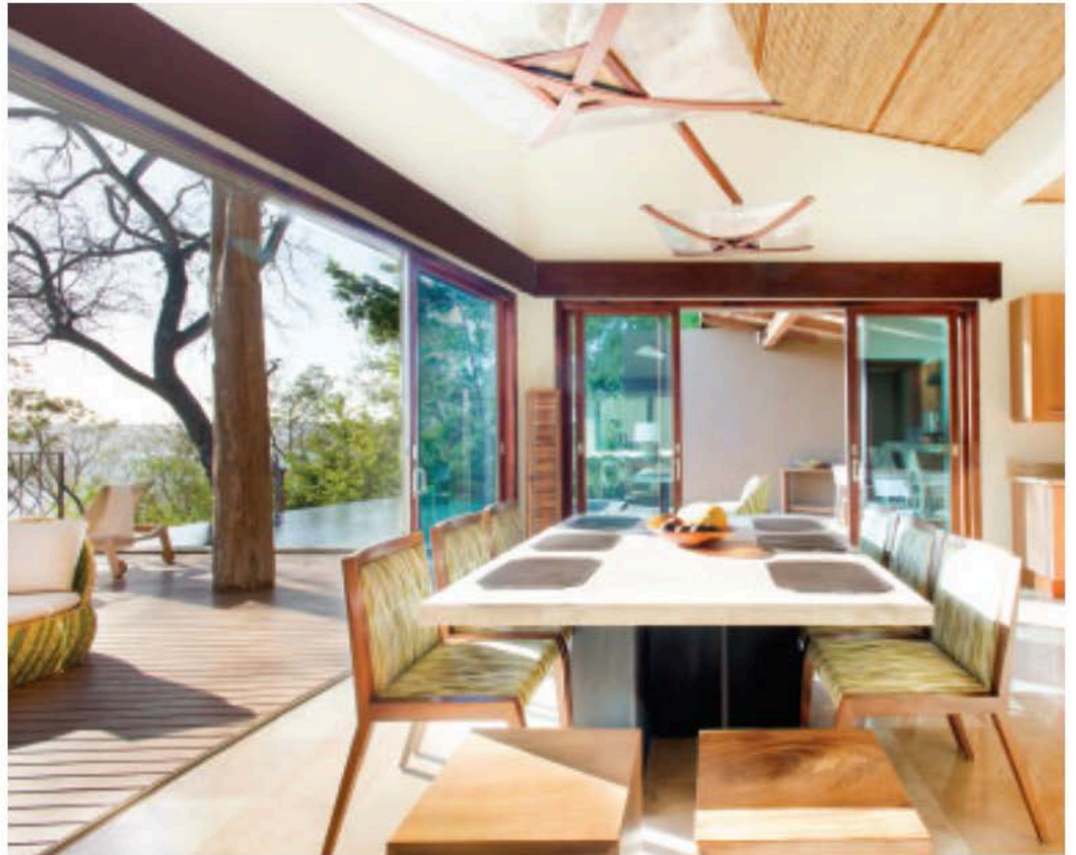
The dining room with pool view at a villa at Exclusive Resorts Peninsula Papagayo.

The villa's open concept begins with a sweeping entryway leading into a large, luxurious lounge space. Completely open, this connects with a dining space (large enough for 10) and gourmet kitchen – all open to the views outside with continuous glass doors waiting to be flung open. The indoor space leads outside to a large »