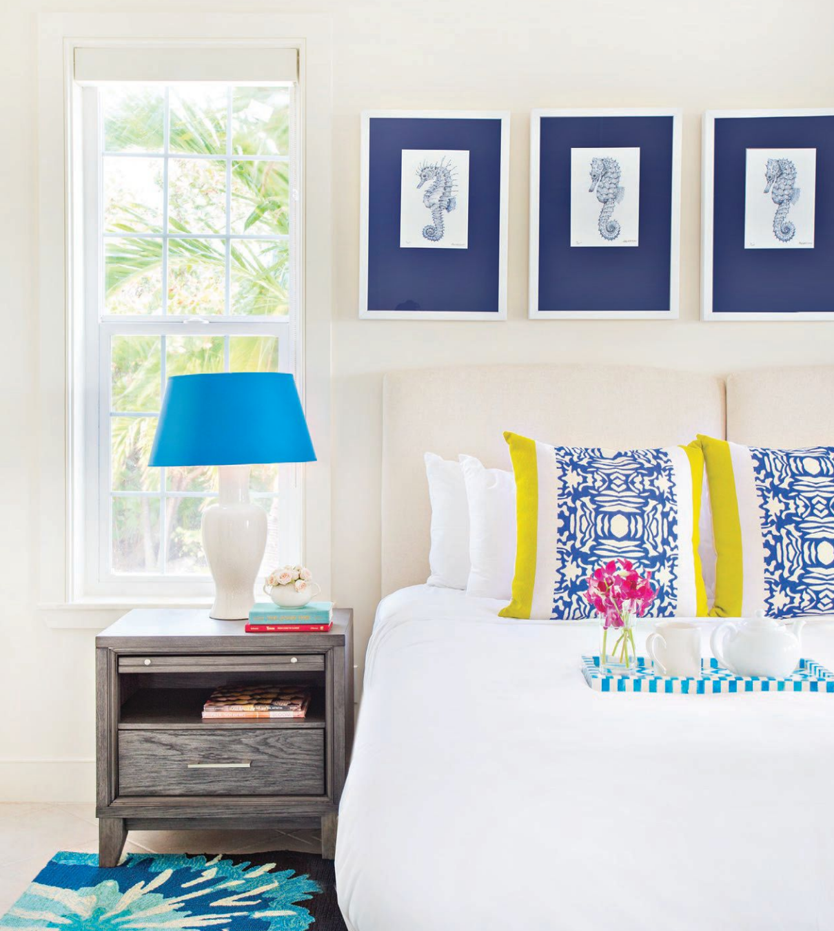
Clockwise from left: With more than 3,000 square feet, each villa has four bedrooms and four full baths with in-home amenities, including private chef dinners and beachside spa treatments; the 18-hole golf course is situated along the Sea of Abaco; Bahamian favorites like conch stew and guava cake are must-try dishes at The Abaco Club's scenic restaurant, The Cliff House.