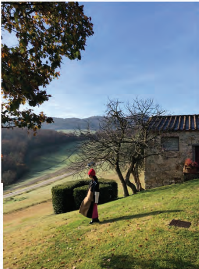
In addition to the main farmhouse, the property has two smaller villas, perfect for multi-family escapes.

The Tuscan sunlight is unlike any other, effortlessly transporting you to a place where reality looks and feels like the most surreal dream. The early morning brings a magical, light fog that rolls over the vineyard-dotted hills in what feels like slow motion. The flare of the sun bringing an extraordinary glow to everything it touches. Tuscany’s beauty has been endlessly explored, the seemingly infinite epicurean delights and surreal natural landscape surely have a lot to do with it. But it is the intangible warmth and the feeling of being “at home” in this foreign place that has even the most well-travelled amongst us returning time and time again to this beloved part of the world.