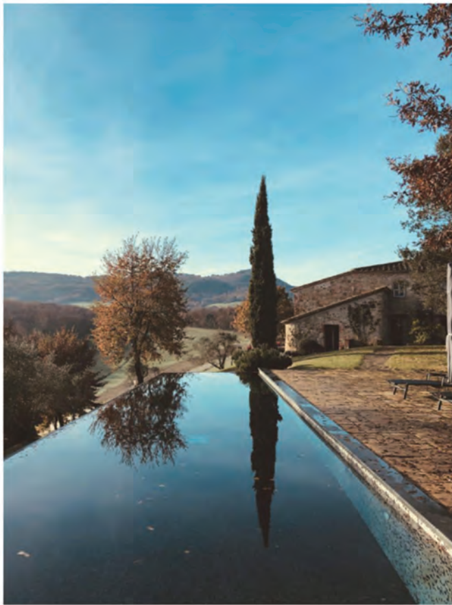
The farmhouses infinity pool overlooks the Tuscan countryside in an idyllic setting.