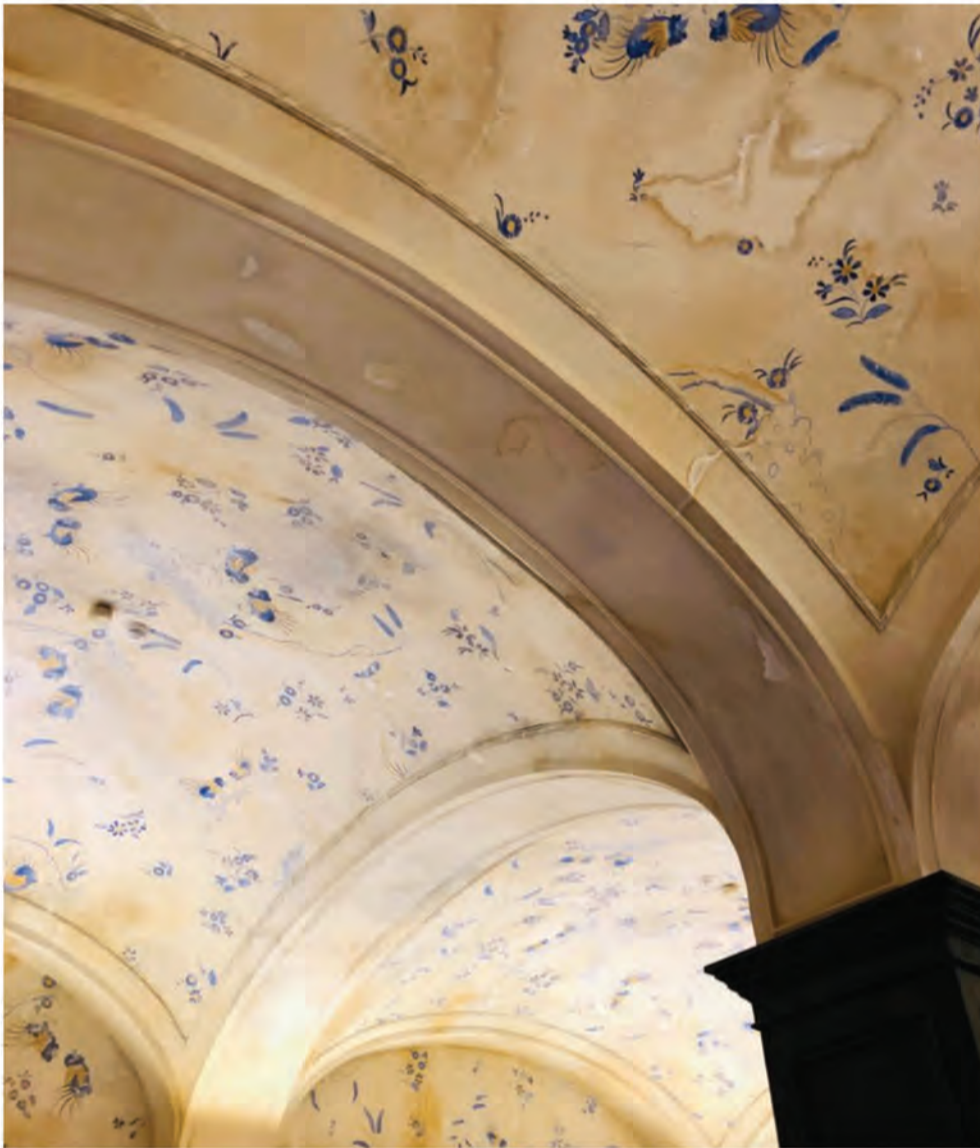
Ginori's hand painted, vaulted ceiling in its Florence flagship further inform the companies commitment to artistic craftsmanship.