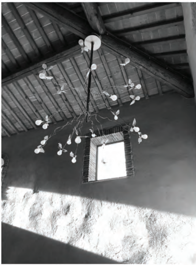
The Ingo Maurer Birds chandelier welcomes guests in the light soaked entry.