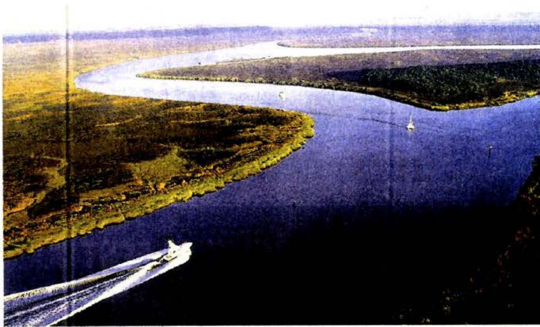
A fishing boat heads out from Sea Island in the hope of reeling in dinner.

While this is a way of life for those who work on commission, the whole team can absorb the concept while fishing on the Atlantic. Strap on the fishing belt, insert the pole and start reeling in dinner. Or not. If, like our group, you only catch little sharks, you won't get anything for the grill, but you will get a photo holding a