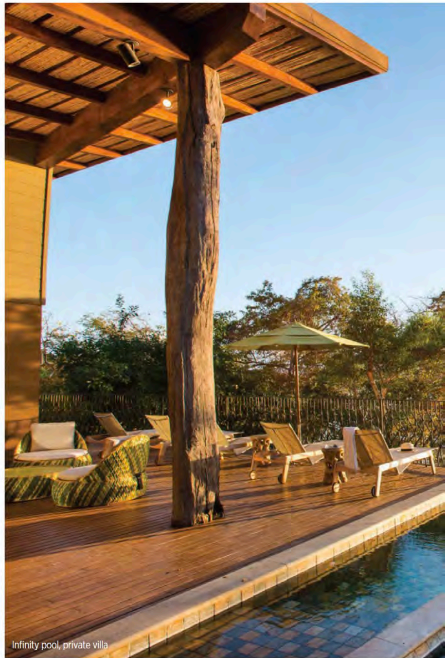
Infinity pool, private villa

When it comes time to drop the forest bathing for a while and actually get some exercise, there are eco-adventure decisions to be made. We have our choice of hikes in the volcanos, dips in the hot springs, ziplining and ATVing, horseback riding and sanctuary visits (cue even more exotic critters). Across the bay and down the coast lies an abundance of beach towns to explore, little local enclaves filled with condos to rent, plus beach bars and boat tours. As you can imagine, the watersports are pretty cool, with snorkelling and diving adventure aplenty. The nearby marina is busy with yacht traffic and I chastise myself that I left the binoculars at home.