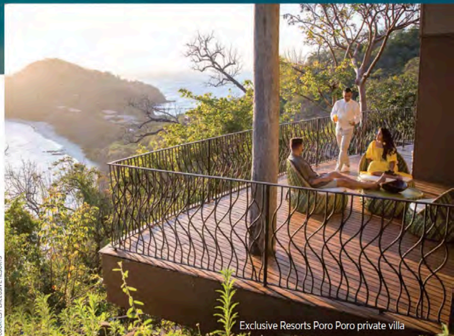
Exclusive Resorts Poro Poro private villa