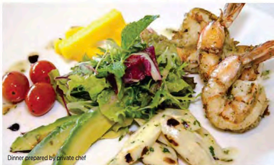
Dinner prepared by private chef

earlier in the day, a dinner kit with everything ready to cook. All we have to do is fire up the barbecue.