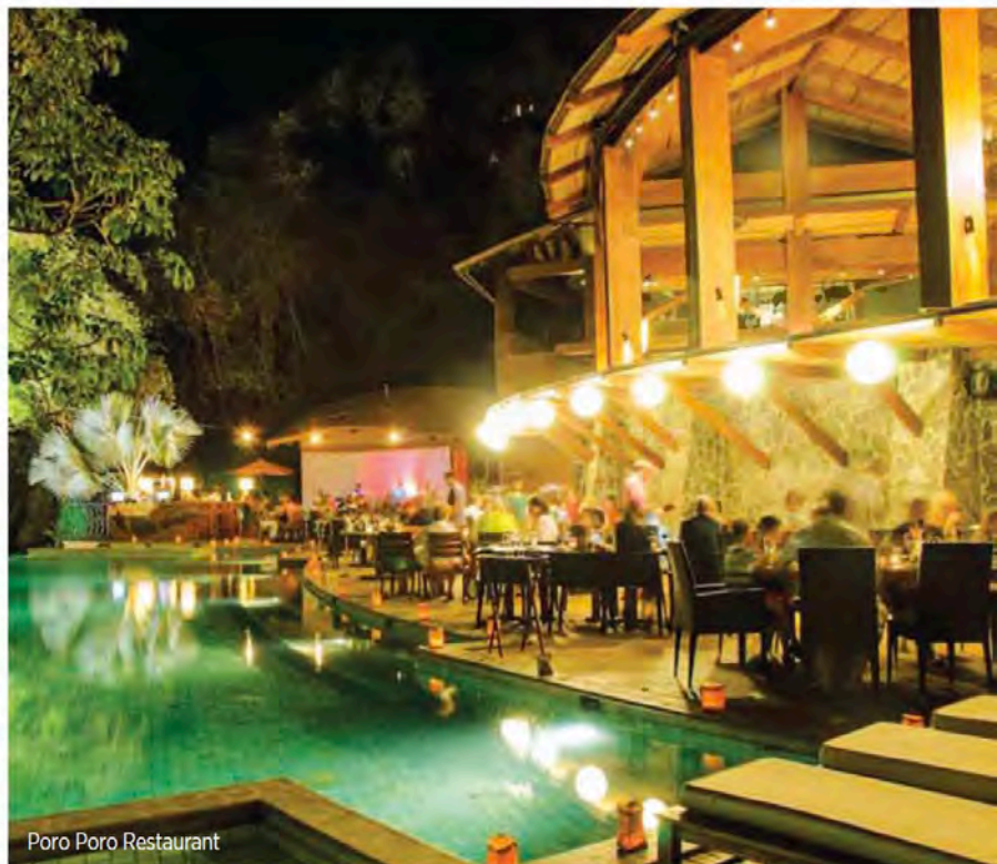
Poro Poro Restaurant