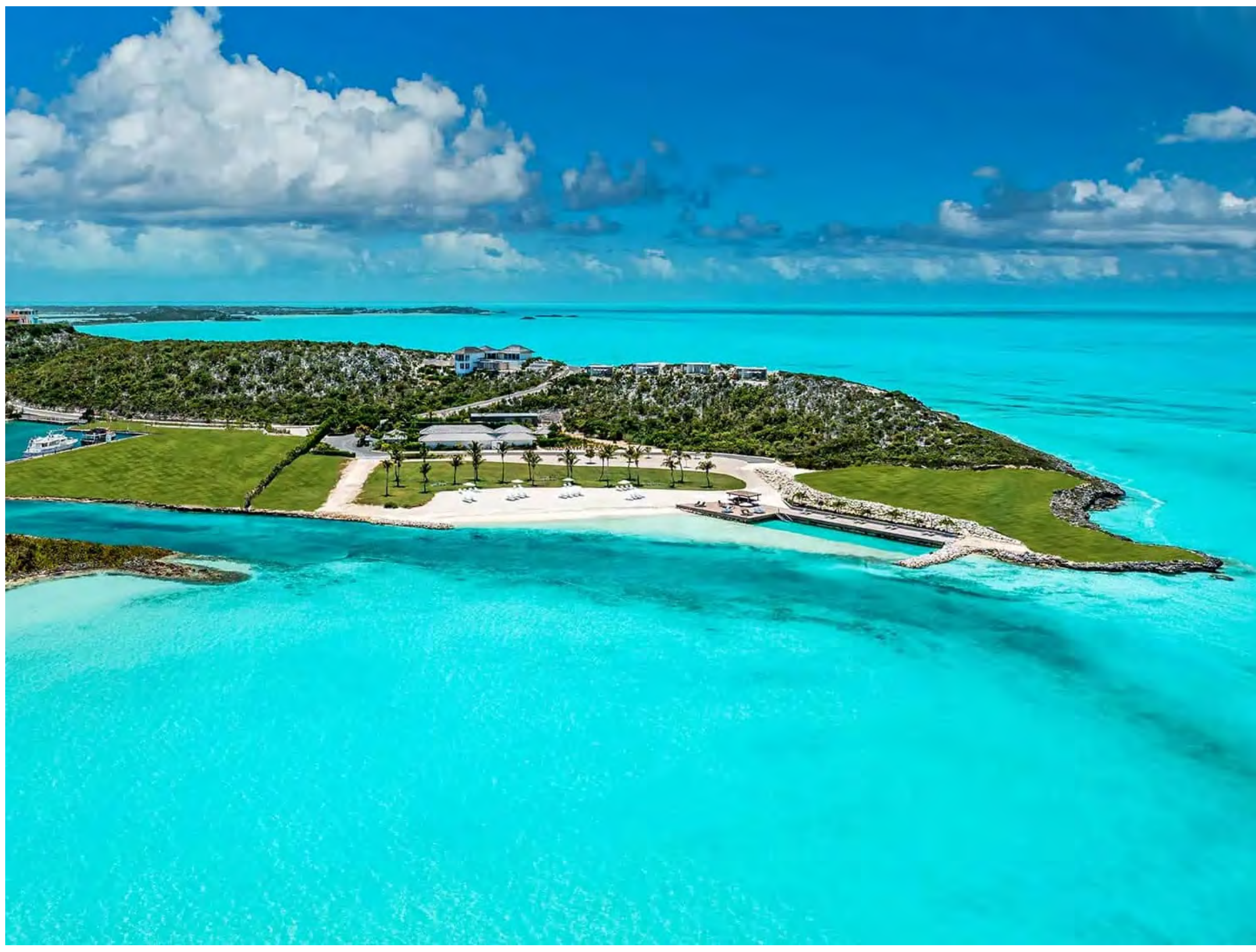
The Beach Club is an idyllic setting for any family getaways or milestone celebrations. Wymara Resort and Villas

Owner Bruce Maclaren was inspired to create this unique amenity after spending many years in Australia, where ocean pools have long been a popular attraction. The resort began construction last October by moving more than 1,500 tons of rock, and the result is a 3,900-sq. ft. pool with shallow and deep ends (the depth depends on the tides), as well as a stunning 4,880-sq. ft. timber deck complete with a bar and enough lounge chairs for an intimate, Instagrammable day.