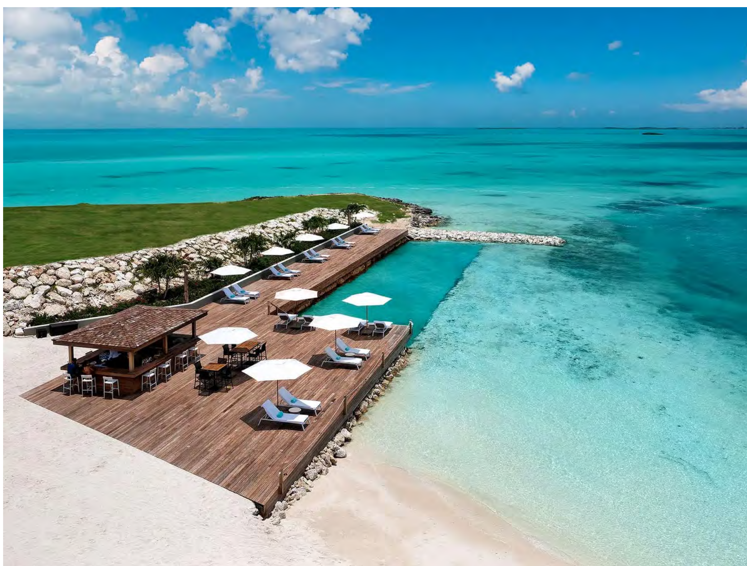
The Ocean Pool is guaranteed to become a hot spot for influencers. Wymara Resort and Villas

Forget death and taxes—if one thing is certain in this world, it's that Caribbean resorts will never stop trying to develop the most creative, extravagant pools we've ever seen. This is especially true on the island of Providenciales in Turks and Caicos, where Grace Bay Beach is so magnificent and alluring that the resorts that are blessed to have it as a backdrop must come up with concepts that will make guests want to remain on-property. In fairness, they all do it very well.